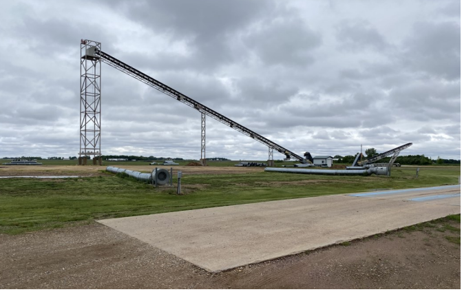
More information & photos at

Electrical Building, (3) 100-bu pits, (2) MASABA 20,000 bph conveyor